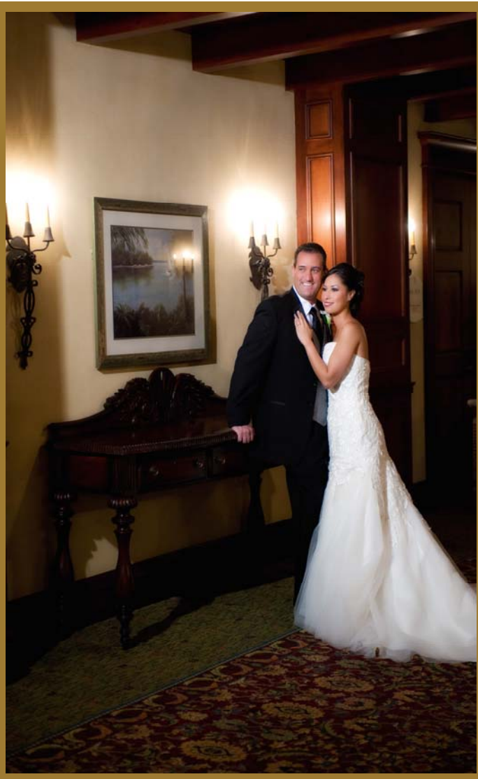
Beautiful Elegance in a rich Tropical setting